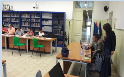
Multiplier Event in Frankfurt Oder(DE)