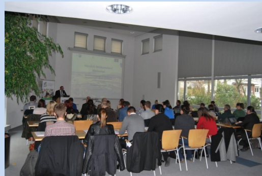
Multiplier Event in Tallinn (EE)